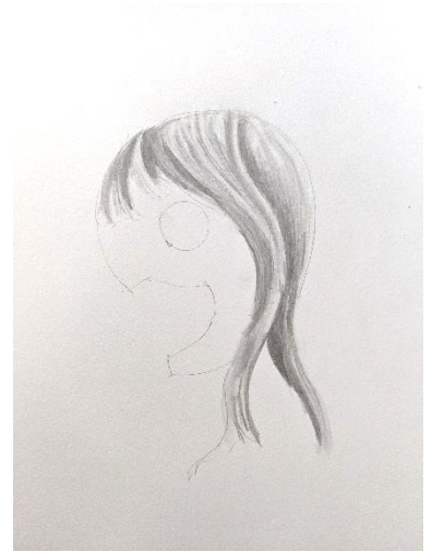
Light and Dark tones